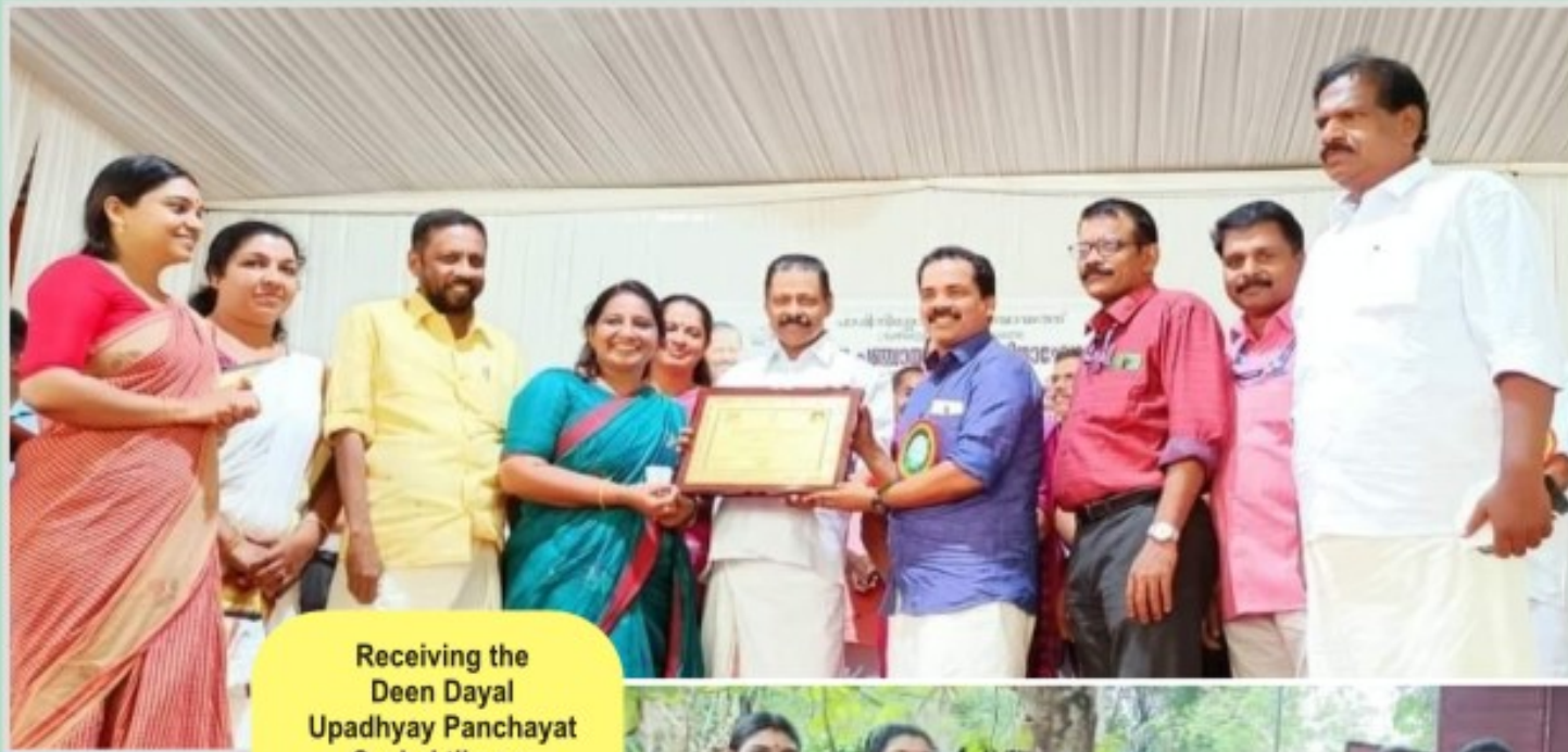
Receiving the Deen Dayal Upadhyay Panchayat Sashaktikaran Puraskar 2022 from the Hon'ble Minister for Local Self Government Shri Govindan Master