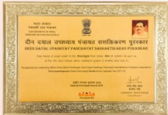
DEEN DAYAL UPADHYAY PANCHAYAT SASHAKTIKARAN PURASKAR - 2019