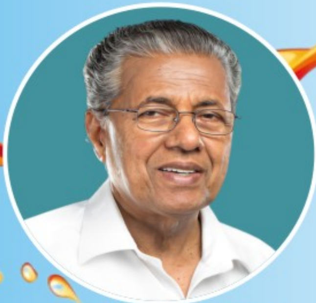
Shri. Pinarayi Vijayan Hon. Chief Minister of Kerala