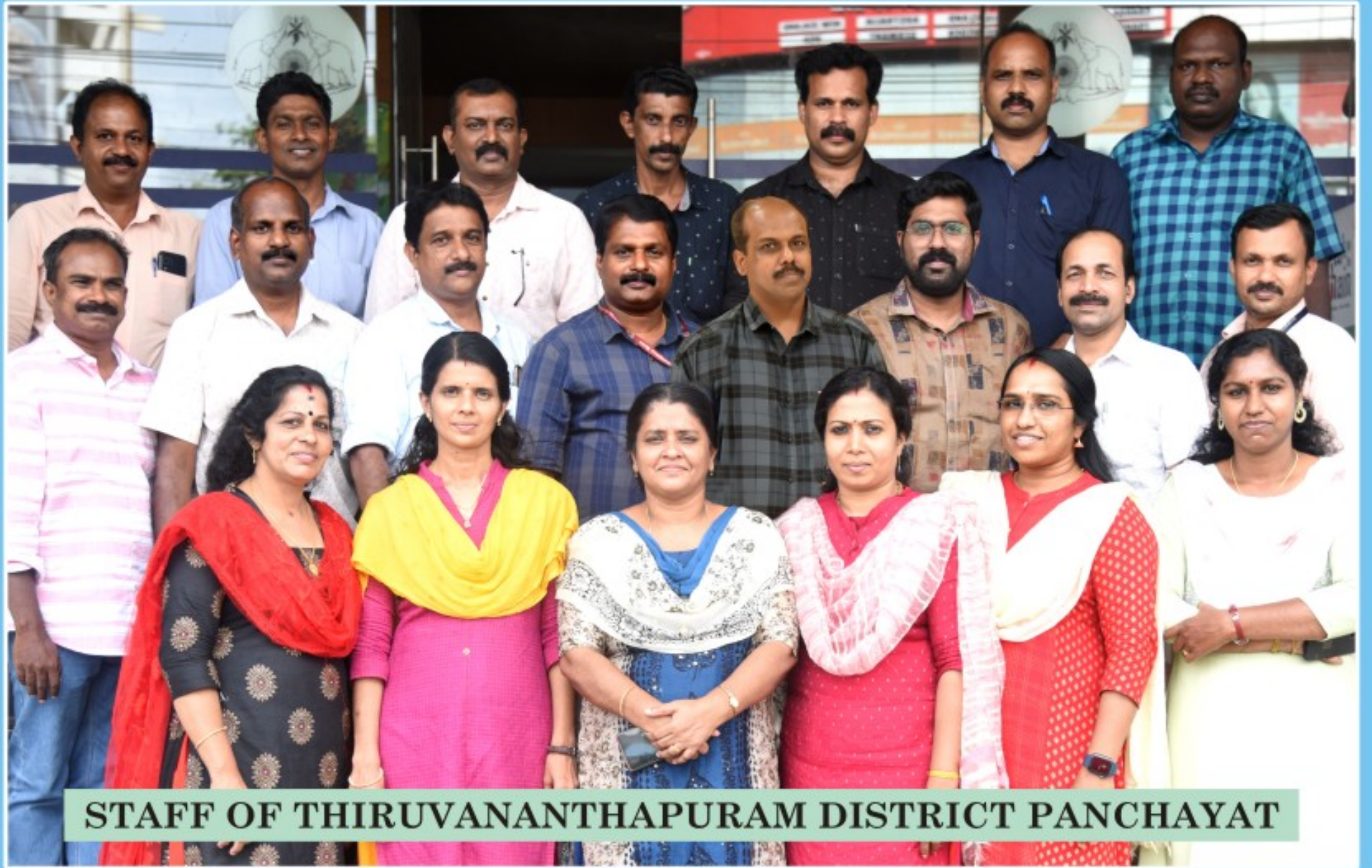
STAFF OF THIRUVANANTHAPURAM DISTRICT PANCHAYAT