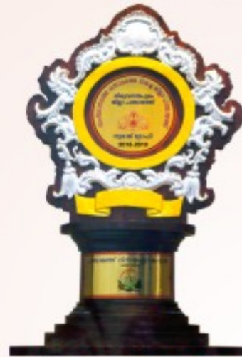
SWARAJ TROPHY 2018-2019