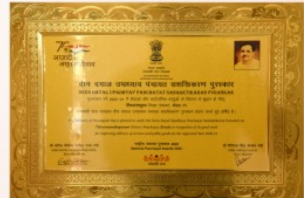
DEEN DAYAL UPADHYAY PANCHAYAT SASHAKTIKARAN PURASKAR - 2022