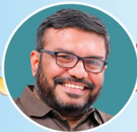
Shri. M.B. Rajesh Minister for Local Self Governments and Excise