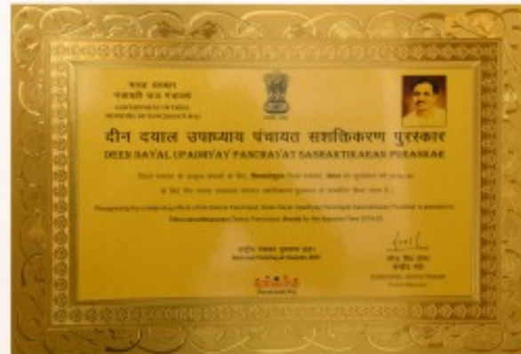
DEEN DAYAL UPADHYAY PANCHAYAT SASHAKTIKARAN PURASKAR - 2021