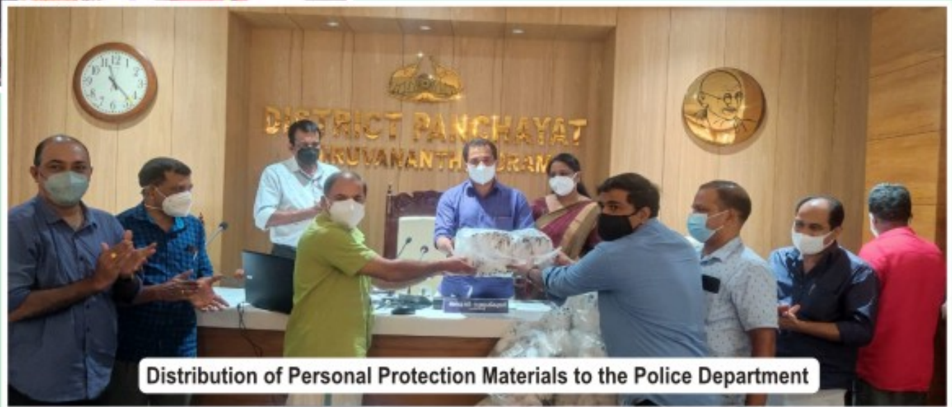
Distribution of Personal Protection Materials to the Police Department