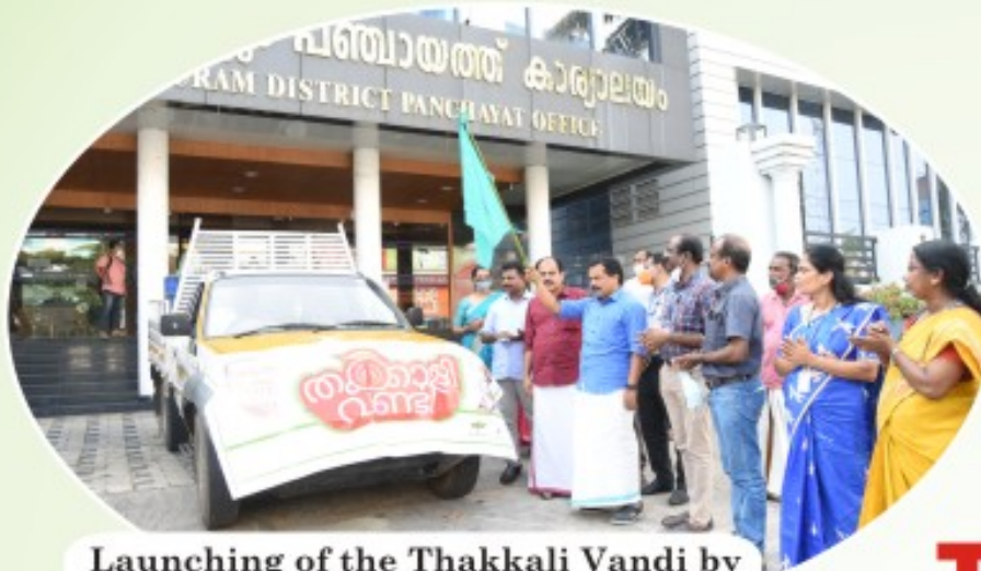
Launching of the Thakkali Vandi by the District Panchayat President