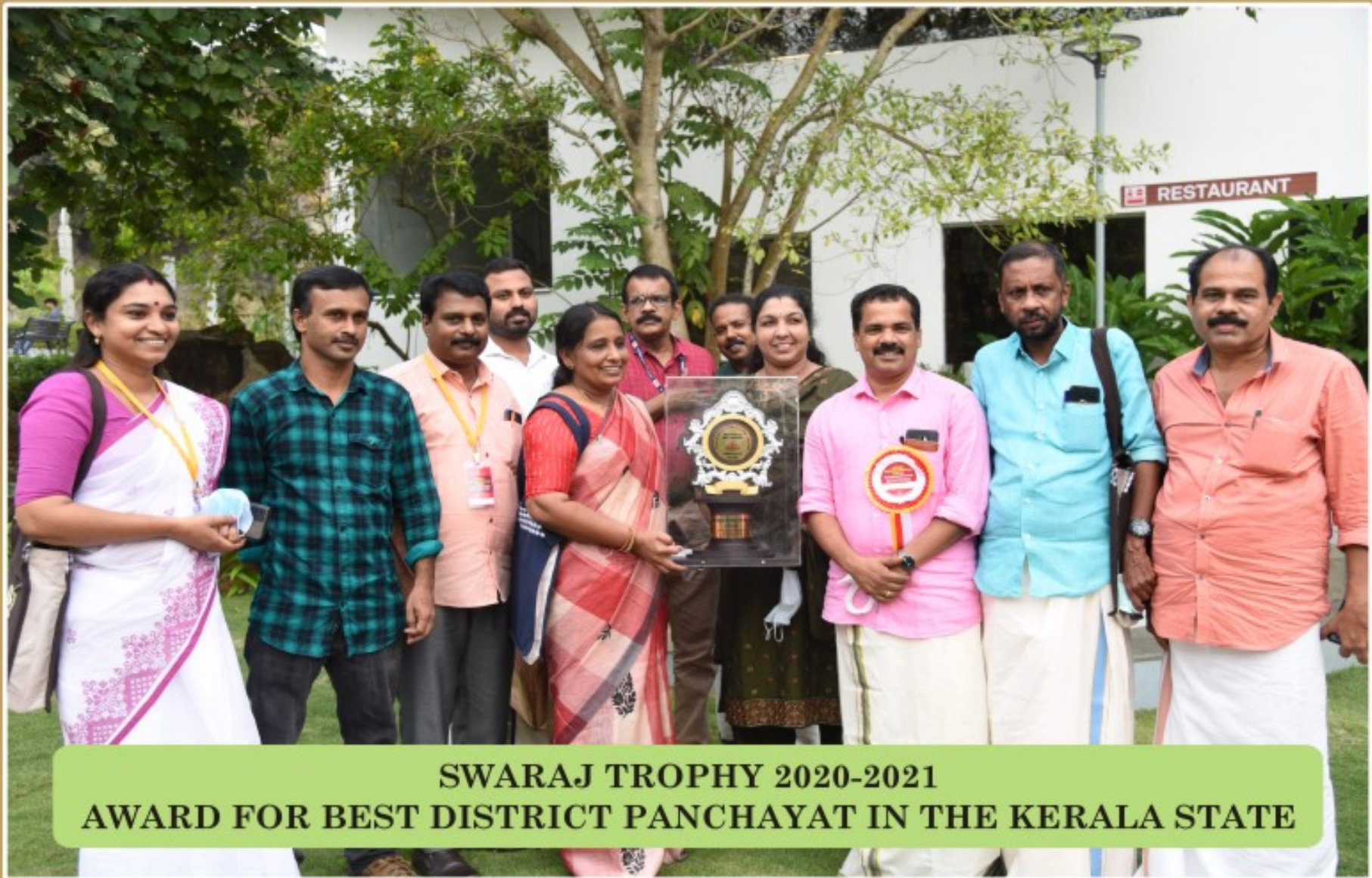
SWARAJ TROPHY 2020-2021 AWARD FOR BEST DISTRICT PANCHAYAT IN THE KERALA STATE