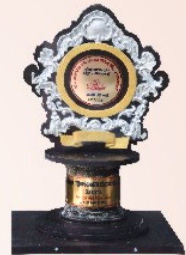
SWARAJ TROPHY 2020-2021